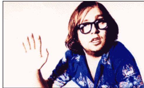
Daniel Kitson: hands up if you want to be in his gang

The BBC is not responsible for the content of external websites